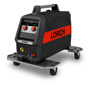
Heavy-duty undercarriage kit