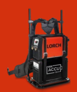
Weld backpack: Maximum flexibility. The system and battery are combined in a backpack to take them with you anywhere.