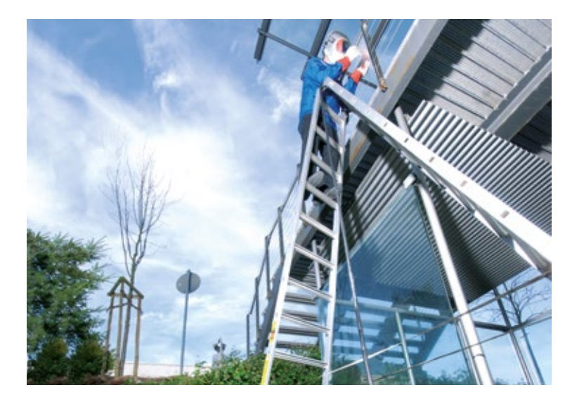
Practical example: The final assembly of a railing – a typical TIG welding job. The stairwell hasn't been connected to the mains yet, though. You will either need a generator, or you can simply connect your Lorch welding device to its battery. That's all it takes!