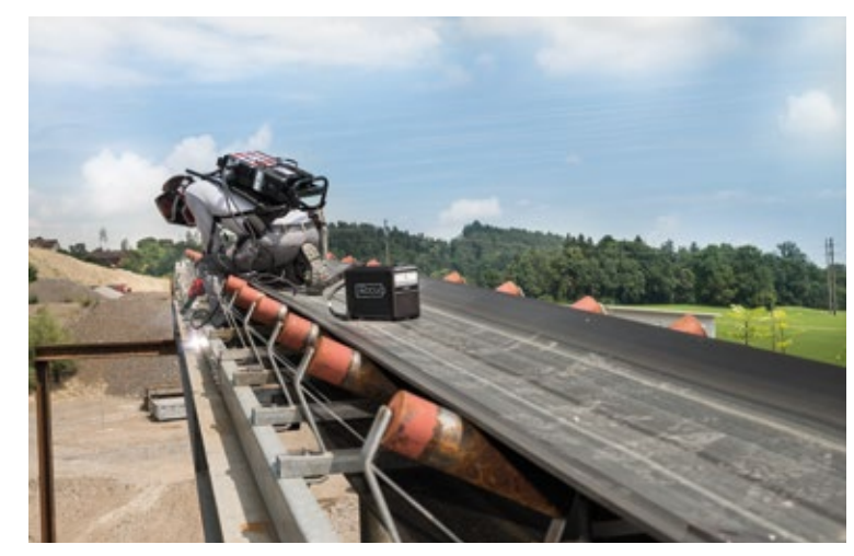
Practical example: You are working outdoors. There is no power outlet and no safe place for a large generator anywhere nearby. You don't mind! All you need to do is use MobilePower for welding!