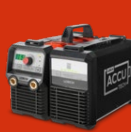
EasyGo 3: System and battery ready at hand side by side.