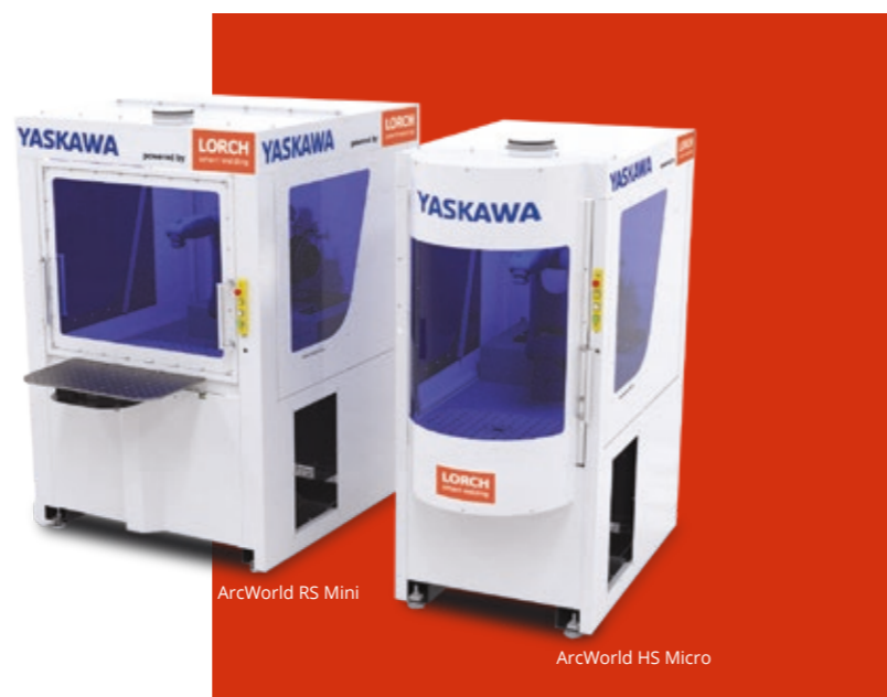
ArcWorld RS Mini

The full robot programming permits precise specification of the welding points while at the same time optimally setting all welding parameters. Offline programming allows advance programming of welding tasks without the workpiece being in the welding cell.