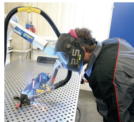
The operator can work directly side by side with the Lorch Cobot. No complex and expensive protective equipment is needed.