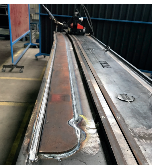
The welding tractor is quick to install with a simple device and produces rework-free uniform weld seams.