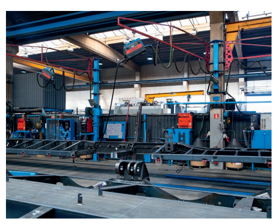
More than 160 MicorMIG 400 are working in the five plants of Faymonville Group. The MIG-MAG welding inverter scores with the SpeedArc process for a focused arc, high welding speed, and simple, multilingual operator guidance.