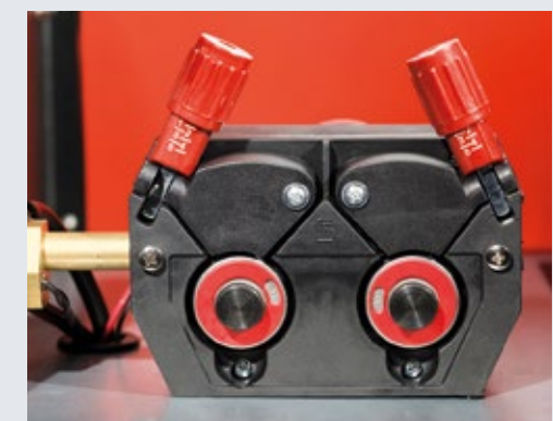
M 304: 4-roll wire feed